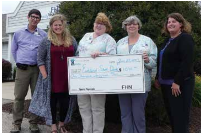
Left: This year's sports physicals at the FHN Family Healthcare Center—Lanark raised $1,040 for Eastland Schools.

783 student-athletes got their check-ups at FHN Sports Physical Clinics this summer, and that means some checks are on the way for Aquin, Chadwick Junior High, Forreston, Lena, Orangeville, Pearl City, Pecatonica, Stockton, Tri-County Christian, and Warren schools!