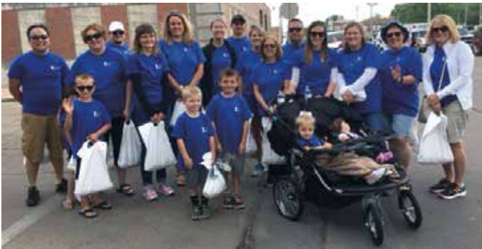
Staffers and family from all over FHN walked in the Dairy Days Parade June 25 in downtown Freeport. This year’s theme was Celebrating Agriculture in Stephenson County .