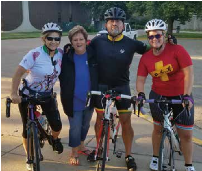
Team FHN rode the 75-mile course in support of friends currently fighting cancer, for families who have lost loved ones to cancer, and in memory of family and friends we have lost to cancer. Funds raised by the annual Tour For Cancer benefit patients of the FHN Leonard C. Ferguson Cancer Center at FHN Memorial Hospital in Freeport.