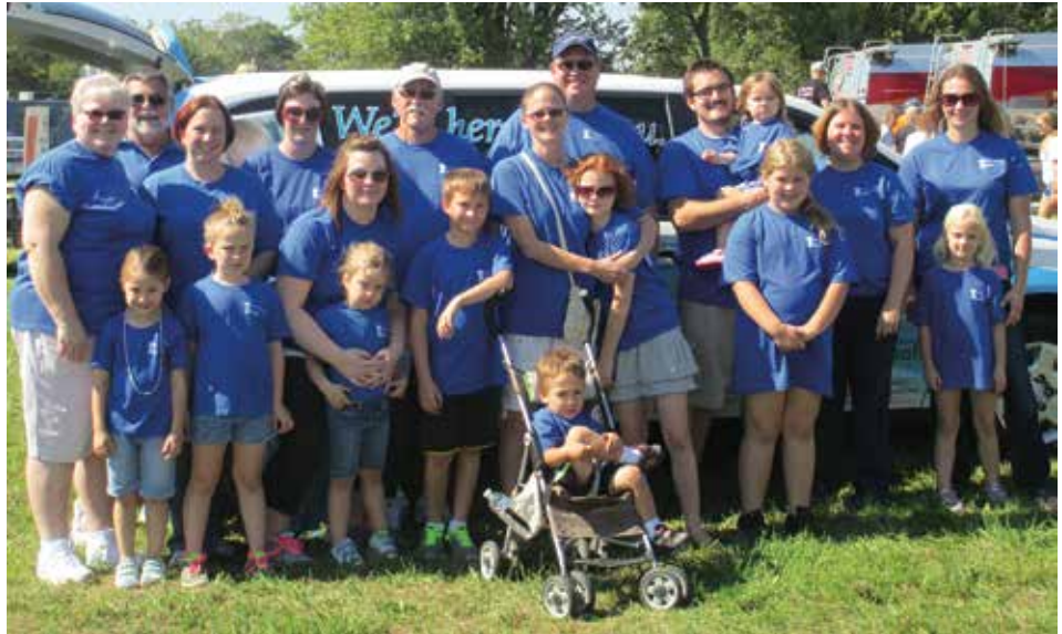
FHN staff and their families shared in the fun Sept. 26 at the Warren Pumpkin Festival Parade . They marched with the FHN van and had treats for kids along the route!

If you have questions about Medicaid or health insurance coverage, call FHN's Certified Application Counselors at 815-599-7950 or toll-free at 1-877-720-1555.