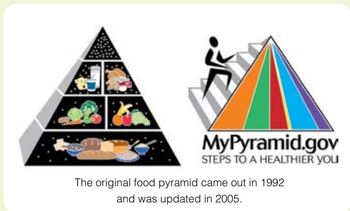
The original food pyramid came out in 1992 and was updated in 2005.

In 1992, we had the USDA (United States Department of Agriculture) food pyramid, with its solid base of bread, cereal, rice and pasta. In 2005, the USDA gave us MyPyramid, which had a stick figure climbing stairs over a colorful vertically striped chart. This year, the USDA debuted its placemat-shaped MyPlate to help us choose the best foods for a healthy lifestyle.