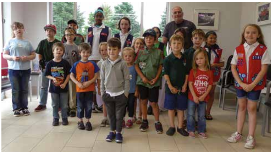
Groups from Trail Life USA and American Heritage Girls Troops visited the FHN/Physicians Immediate Care Urgent Care Clinic for some valuable outdoor tips and a tour of the Freeport facility.

with convenient, walk-in urgent care services, including school and sports physicals, with extended hours seven days a week; no appointment needed.