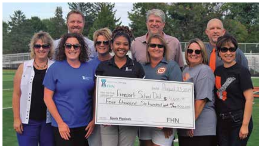
FHN and Freeport School District staff at the 2019 sports physical check presentation ceremony.

We’re excited to be able to give back $16,500 to 14 area school districts this year. We’re glad to be a part of your community, and so proud to support our local schools!